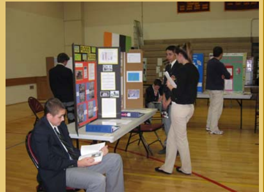
Guest judges review science projects and ask questions at the GMA 8th Grade Science Fair on January 21st.